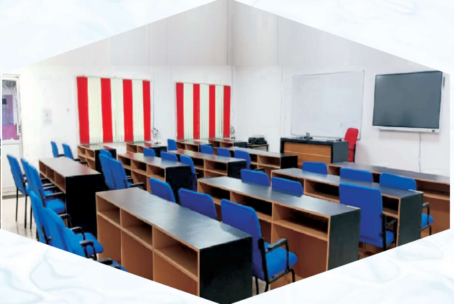
Class Room III