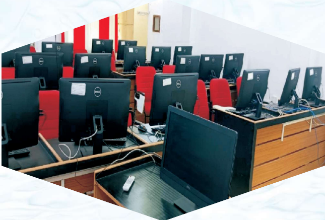
Class Room II (Computer Lab)