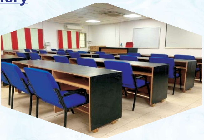
Class Room I