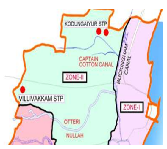
urbanized areas is about 225 MLD

The Chennai city is covered with 98% sewer network. There are 12 sewage